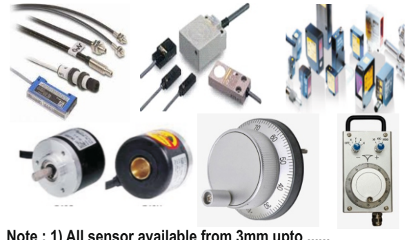
Note: 1) All sensor available from 3mm upto .....

2) Capacitive sensor available in M8 / M12 / M18 / M30 sizes